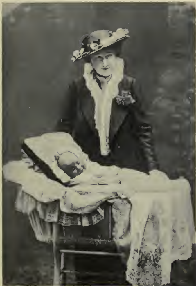
THE PRINCESS VICTOR NAPOLEON, WITH HER INFANT SON.